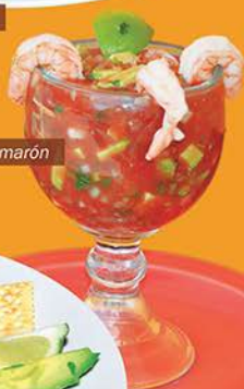
Cóctel de Camarón