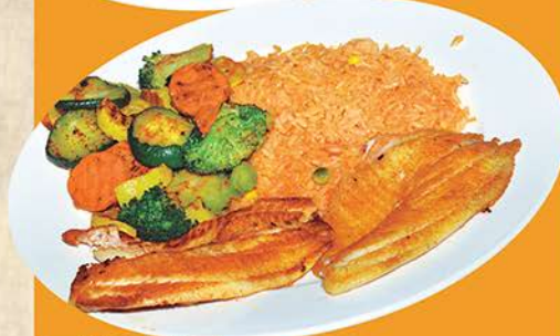
Tilapia del Río