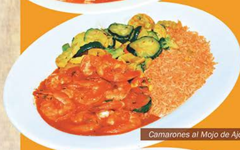
Camarones al Mojo de Ajo