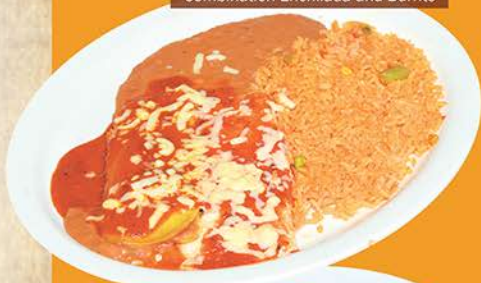
Combination Enchilada and Burrito

A bed of rice topped with grilled shrimp and cheese dip. ~14.49